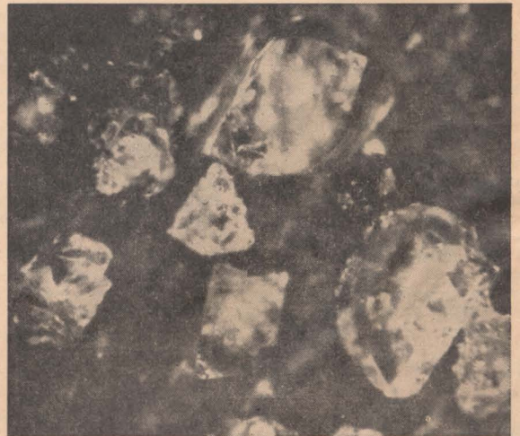
MAN-MADE DIAMONDS —A photomicrograph showing diamonds made in the Research Laboratory by the Hall-Wentorf process.

pressure and high temperature, GE scientists gained valuable help from nature, particularly from studies of diamonds found in Arizona meteorites. General Electric attaches great im-